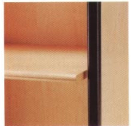
Mentor Version I work surface features a bull-nose edge treatment with reveal.