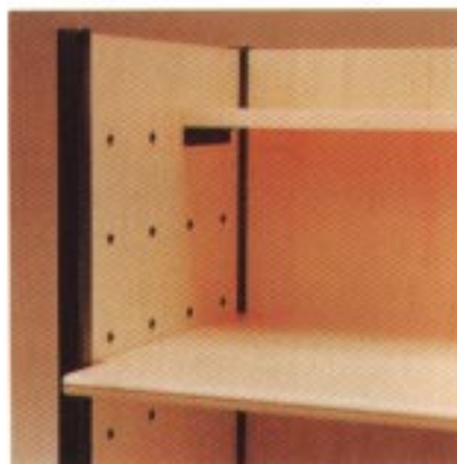
Grid pattern indicates work surface height and depth adjustments.