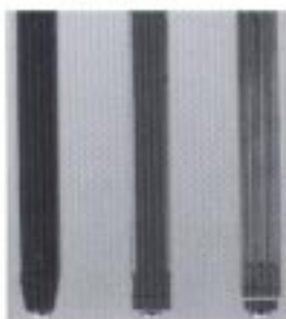
CSL1 Tapered CSL2 Chamfered CSL3 Fluted